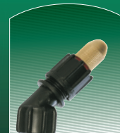
Adjustable Cone and Fan Nozzle