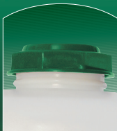
4" Filtered Opening