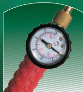
Pressure Gauge for Maximum Efficiency