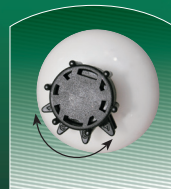
4 Position Pressure Control Valve