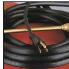
Model #60640 115 Volt