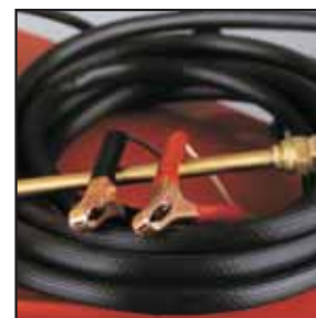
Model #60650 12 Volt