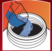
4" Large Opening