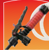
Comfort Grip Handle