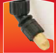
Brass Nozzle Handle